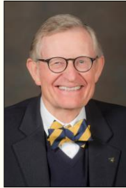
Dr. E. Gordon Gee